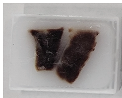
Immunohistochemistry (IHC). Hematoxylin and eosin (H&E) image taken from representative Human Placental Tissue (Normal) - FFPE Block (Item No. 45048) (4X).