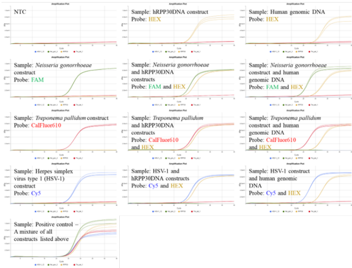
Figure 1: Verification experiments with single and multiple targets (given in text boxes for each panel). All sets of probes and primers are present in every reaction, but positive signal is only observed when the target(s) is present, indicating that the amplification is specific.

The limit of detection (LOD) was estimated by performing serial dilution experiments in triplicate (Figure 2). For dilution series only target construct was added. The results show a limit of detection (LOD) <10 copies/reaction.