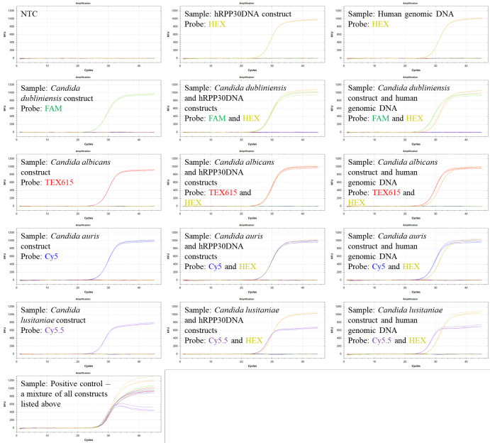
Figure 1: Verification experiments with single and multiple targets (given in text boxes for each panel). All sets of probes and primers are present in every reaction, but positive signal is only observed when the target(s) is present, indicating that the amplification is specific.

Experiments were performed in triplicate using the experimental procedure given above, but with different samples added to each reaction. The samples used for the verification experiments contained 1×10 4 copies/reaction of synthetic 500 bp DNA constructs (from Twist Biosciences) harboring the regions of interest from the pathogen genomes, human RPP30 DNA gene, and human genomic DNA. Figure 1 shows the results of these experiments, which indicate that the 5-plex specifically detects the different pathogens.