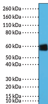
WB of Jurkat cell lysates using CD5 (N-Term) Rabbit Monoclonal Antibody (Clone RM354) at a dilution of 1:25,000.