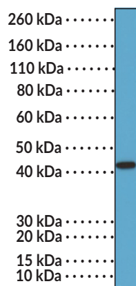
WB of LNCaP cell lysates using AMACR (N-Term) Rabbit Monoclonal Antibody (Clone RM349) at a dilution of 1:1,000.