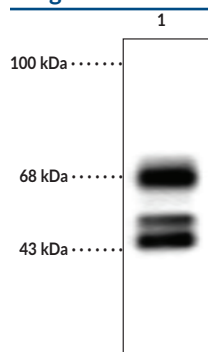
Lane 1: Rat cortical lysate

WB of rat cortical lysate showing specific immunolabeling of the ~46/48 kDa FOX1 protein.